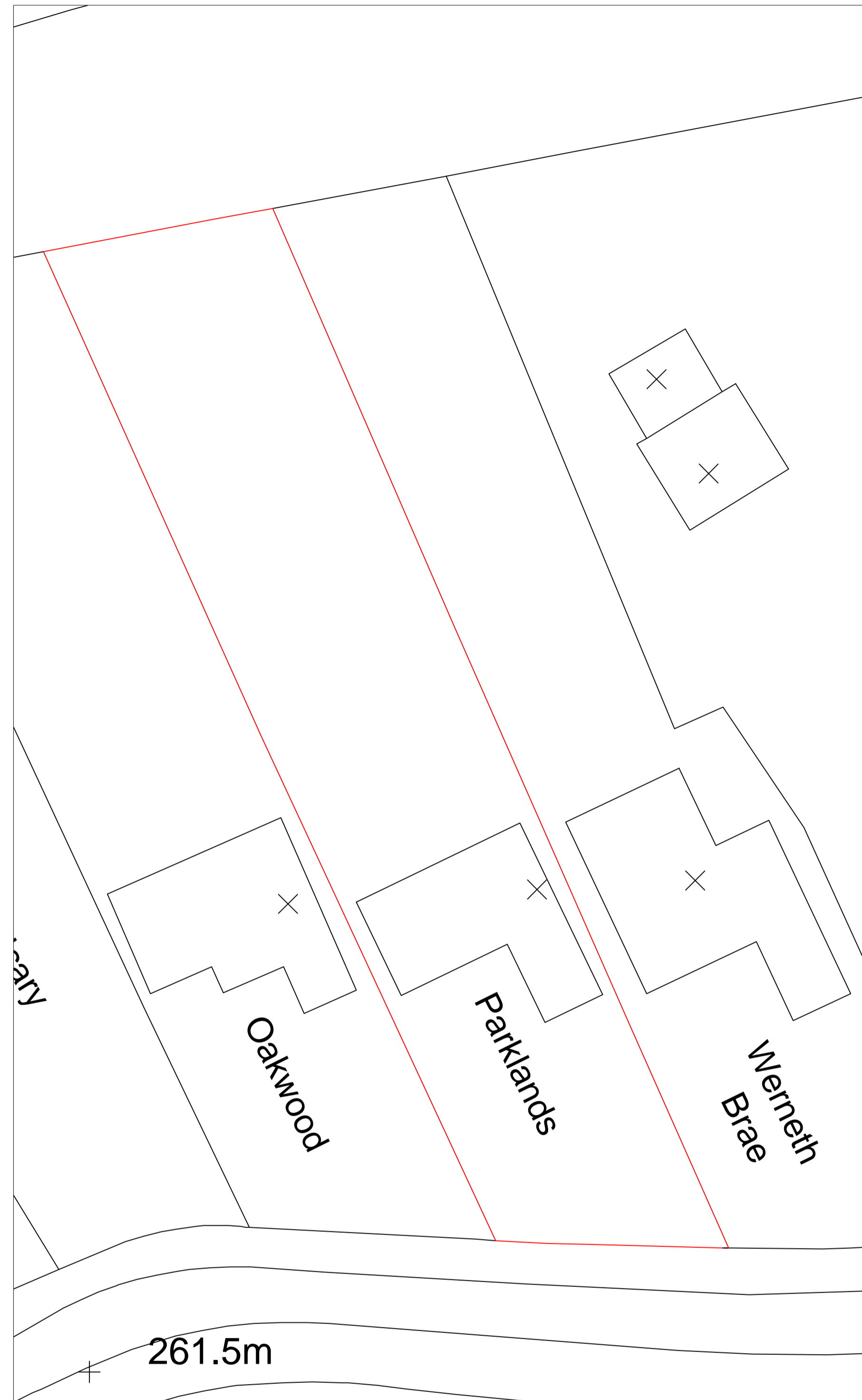
Existing Site Plan