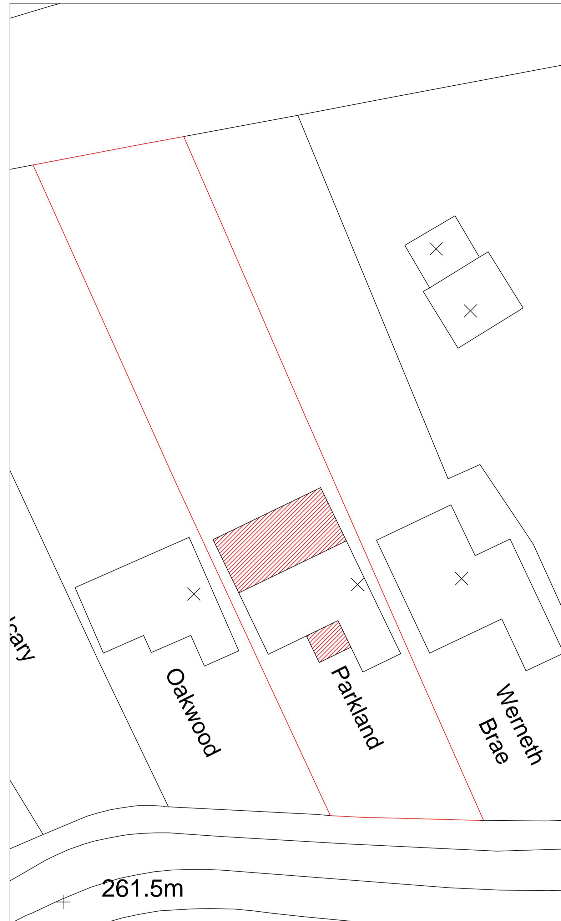
Proposed Site Plan